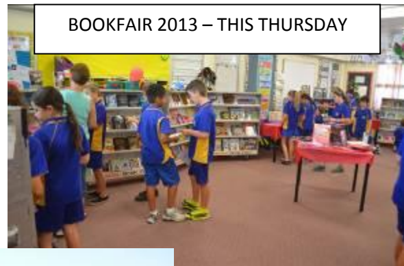
BOOKFAIR 2013 – THIS THURSDAY

Our next fun activity will be RSPCA and Mackay Pet Rescue Fundraising Day on Friday 15 November . This has been organised by our Year 7 students and they have a dress up opportunity for a gold coin donation as well as sales of icy cups and party cakes and a pet photo competition. We are very pleased to see that our students are building relationships with the community.