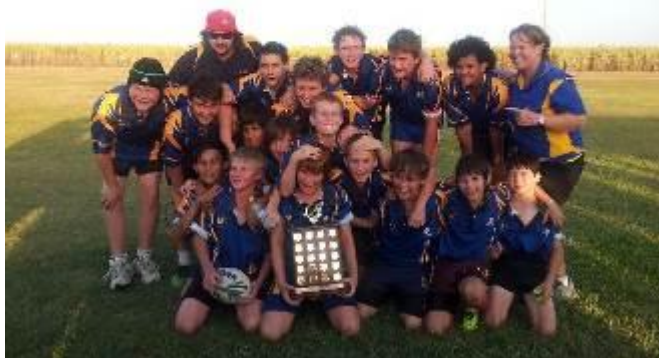
KING OF THE VALLEY – MARIAN STATE SCHOOL