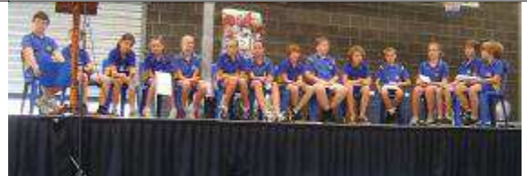
School Captain 2013 nominees

We wish our new Captains a fantastic 2013 and I know they will do a great job.